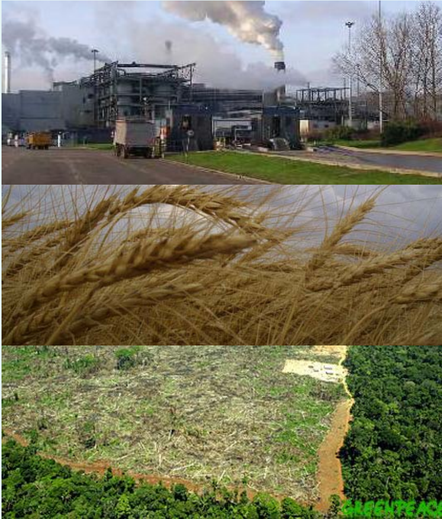
% WTW GHG savings compared to petrol or diesel